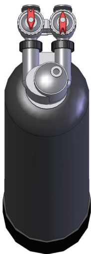
TAC844 with bypass head